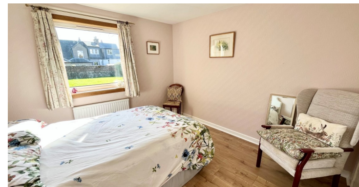
3 Gibson Close