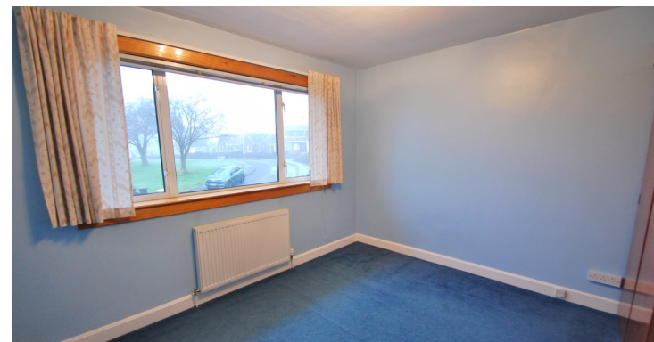
11 Dunmar Crescent