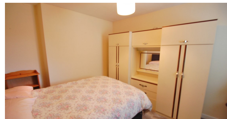
7 Sawers Avenue