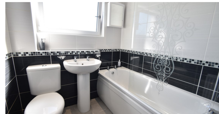
11 Eriksay Court