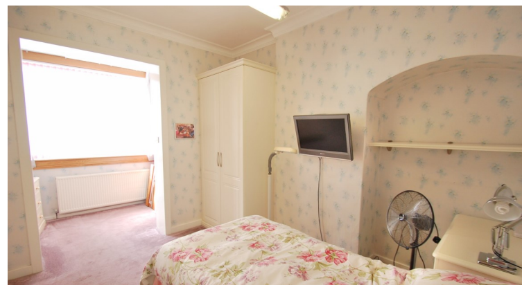
5 Gartcows Crescent

Viewings: Strictly by appointment through Caesar & Howie on 01506 435306 or email mam@caesar-howie.co.uk