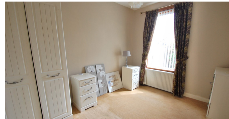
10 Moncks Road