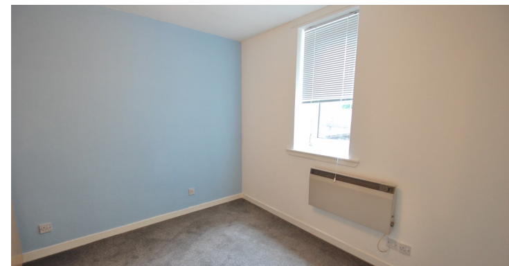
8 Church Court Apartments