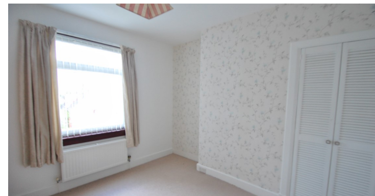
14 Prospect Street