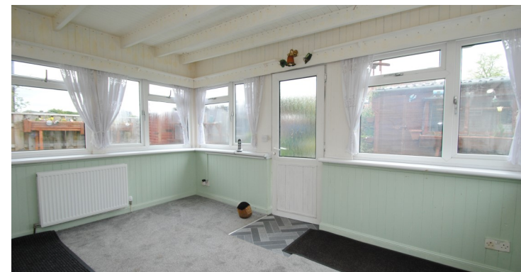
2 Hawkhill Road