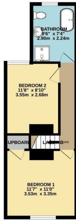
1ST FLOOR 349 sq.ft. (32.4 sq.m.) approx.