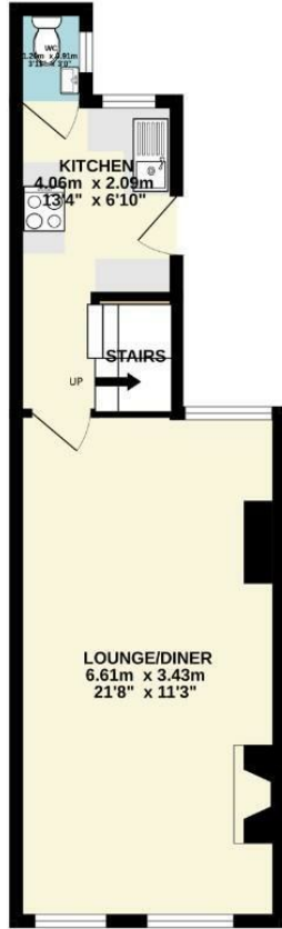
GROUND FLOOR 31.2 sq.m. (336 sq.ft.) approx.