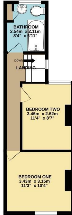
1ST FLOOR 30.6 sq.m. (329 sq.ft.) approx.