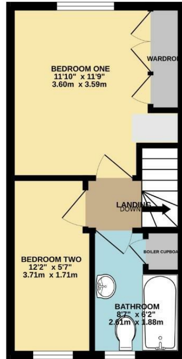
1ST FLOOR 282 sq.ft. (26.2 sq.m.) approx.