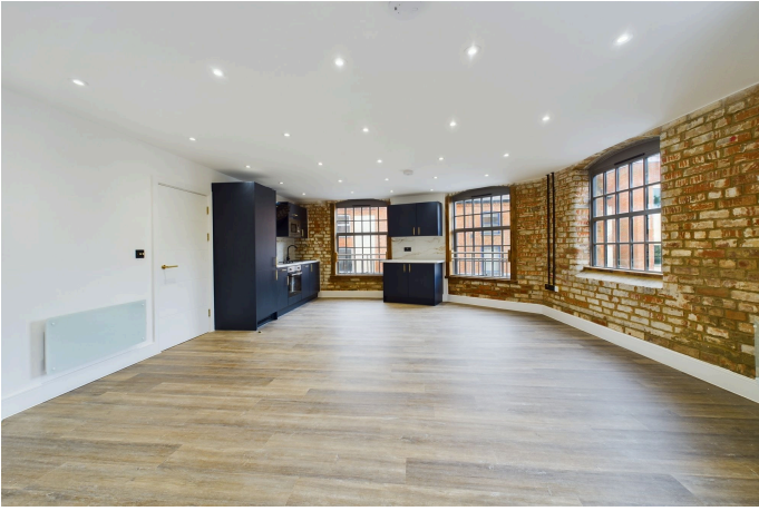
Flat 1, Hawkins Court, 82 Overstone Road, The Mounts, Northampton NN1 3LA £185,000 Leasehold