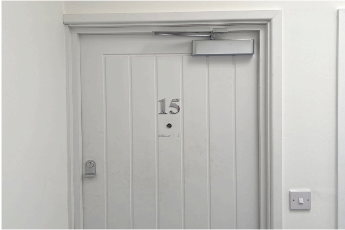
Flat 15 The Bloc Haus, 52-56 Hazelwood Road, Northampton NN1 1LN £150,000 Leasehold