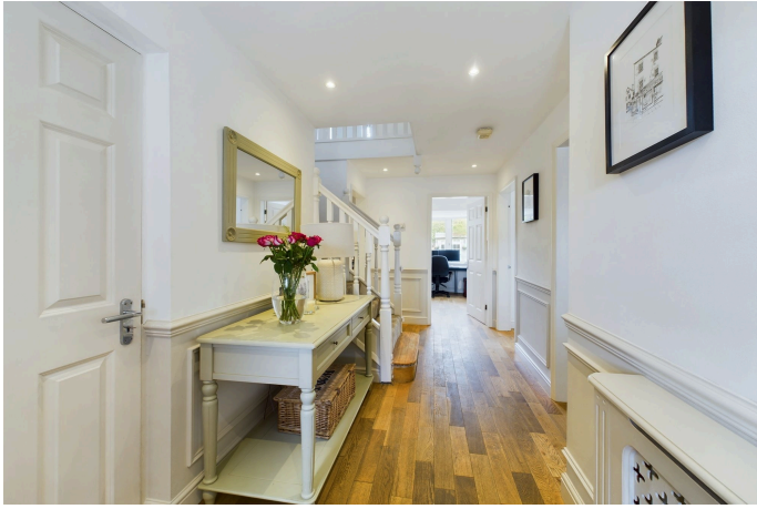
36 Ashpole Spinney, Hunsbury Meadows, Northampton NN4 9QB Guide Price £485,000 Freehold