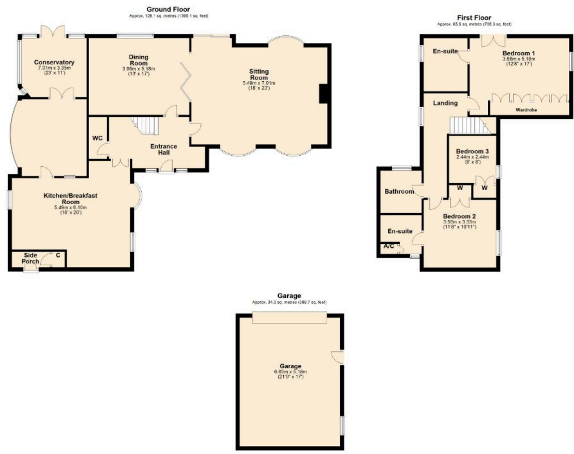
Total area: approx. 229.0 sq. metres (2485.1 sq. feet)

Located to the south of Northamptonshire and just north of Buckinghamshire, Hartwell is less than 5 miles from M1 J15 and only 8 miles from the centre of Northampton. Within the village itself are a parish church, the outstanding Ofsted rated primary school and similarly rated pre-school, public house, community centre, a pocket park, and village shop. However, Hartwell is best known for being situated next to Salcey Forest, a former medieval hunting forest which is still commercially active for timber products and is now managed by the Forestry Commission, and has walking, biking and riding trails. Additional facilities and amenities can be accessed in the nearby larger village of Roade 2 miles away, with high street shopping and local government provisions being available in Northampton along with a mainline rail service to both London Euston and Birmingham New Street. Milton Keynes centre and train station are located within 10 miles.