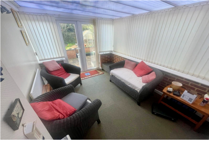
20A Kendal Close, Boothville, Northampton NN3 6WJ £325,000 Freehold