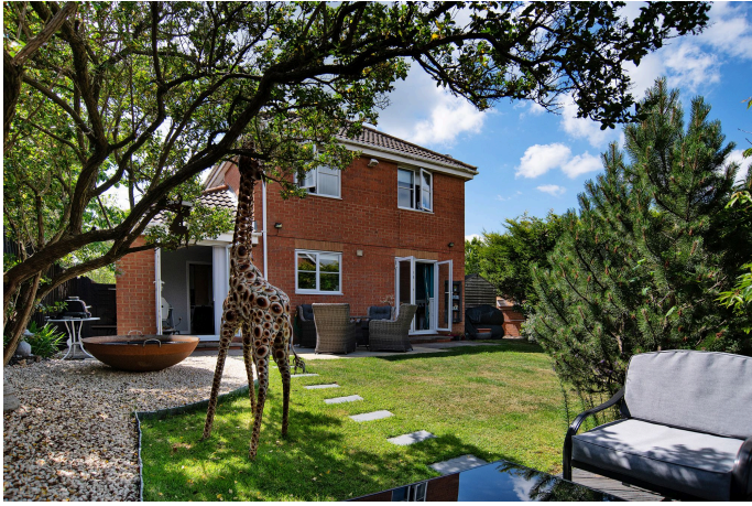
1 Barley Close, Lang Farm, Daventry NN11 0FW £389,000 Freehold