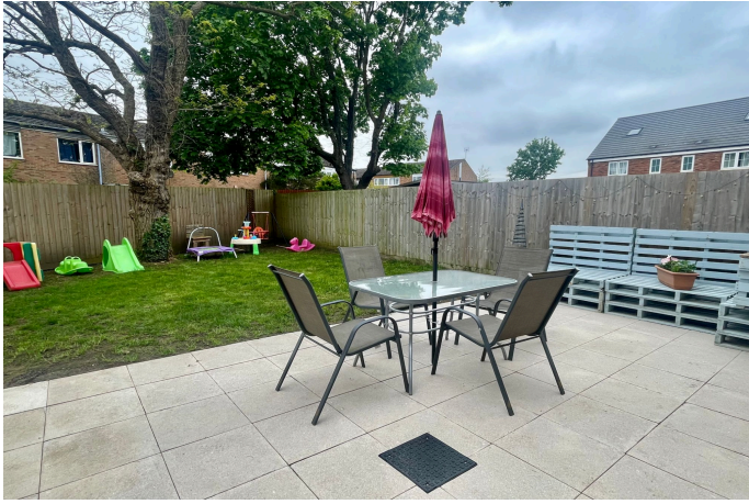
24 Willow Brook, Daventry, Northants NN11 4FU £324,999 Freehold