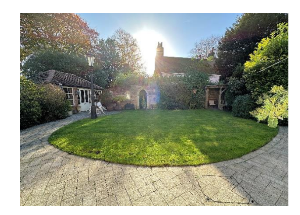
Summerhouse:-17' 7'' x 9' 10'' (5.36m x 2.99m) Maximum Measurements

Brick built, windows and double opening doors overlooking the garden, original flagstone floor and power connected.