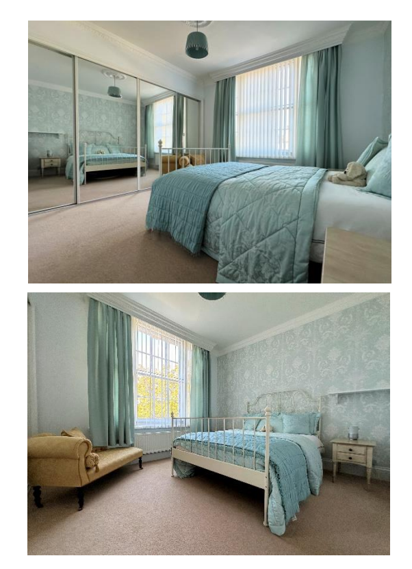
Bedroom Four:- 12' 2'' x 11' 1'' (3.71m x 3.38m)

Secondary glazed sash window to side elevation, radiator, mirror fronted sliding doors to built-in wardrobe and decorative coving to flat ceiling with central ceiling rose.