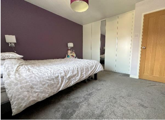
Bedroom Two:- 13' 3" x 9' 11" (4.04m x 3.02m) Maximum Measurements

UPVC double glazed window to rear elevation overlooking the garden, radiator and flat ceiling.