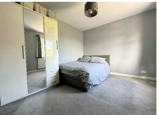
Bedroom Three:- 11' 9" x 8' 1" (3.58m x 2.46m)

UPVC double glazed window to front elevation, radiator and flat ceiling.