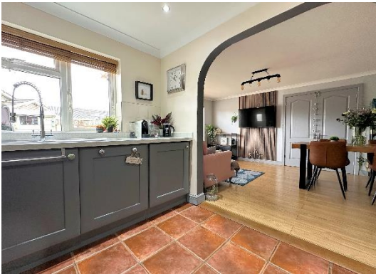
Dining/Family Room:- 15' 4" x 11' 2" (4.67m x 3.40m)

A large UPVC double glazed window to rear elevation overlooking the garden, radiator, space for table and chairs, attractive feature wood panelling to wall, TV aerial point and part double glazed composite door to garden. Further double opening internal doors to: