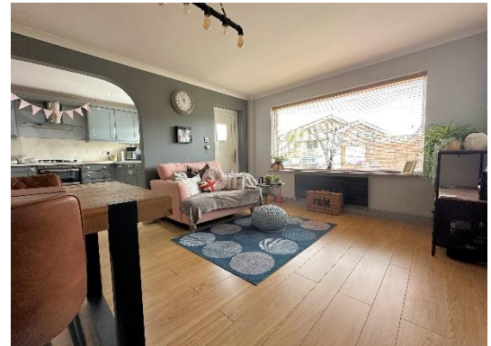
Lounge:- 13' 7" x 13' 6" (4.14m x 4.11m)

A large UPVC double glazed window to rear elevation overlooking the garden, radiator, space for table and chairs, attractive feature wood panelling to wall, TV aerial point and part double glazed composite door to garden. Further double opening internal doors to: