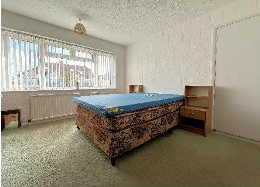
Bedroom Two:- 8' 11" x 6' 11" (2.72m x 2.11m)

UPVC double glazed window to rear elevation and textured ceiling.