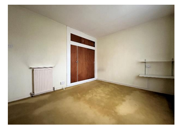
Bedroom Three:- 7' 10'' x 7' 5'' (2.39m x 2.26m)

UPVC double glazed window to front elevation and radiator.