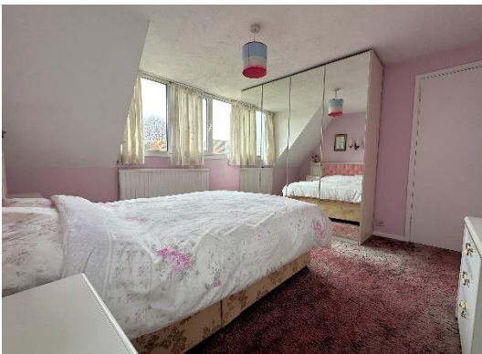
Bedroom Two:- 12' 2" x 11' 11" (3.71m x 3.63m) Maximum Measurements

Dual aspect room with UPVC double glazed windows the front and side elevations, radiator, built-in storage cupboard and textured ceiling.