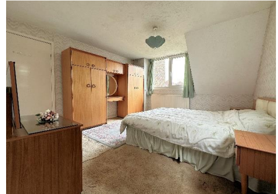
Bedroom Three:- 11' 11" x 7' 0" (3.63m x 2.13m) Maximum Measurements

UPVC double glazed window to rear elevation overlooking the garden, radiator and textured ceiling.