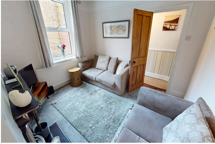
20 Port Road, Duston, Northampton NN5 6NL £269,995 Freehold