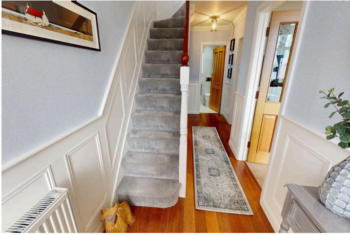
57 South View, Kislingbury, Northampton NN7 4AR £475,000 Freehold