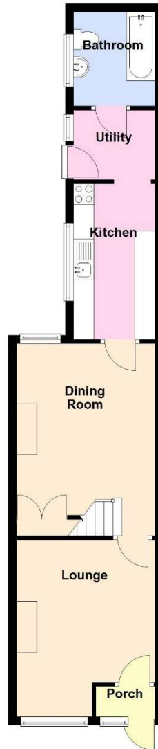
Ground Floor Approx. 47.2 sq. metres (508.3 sq. feet)