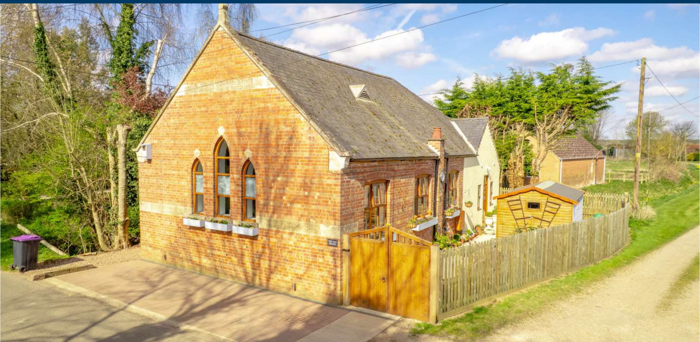
The Old Chapel, Chapel Road, Tumby Woodside, PE22 7SP