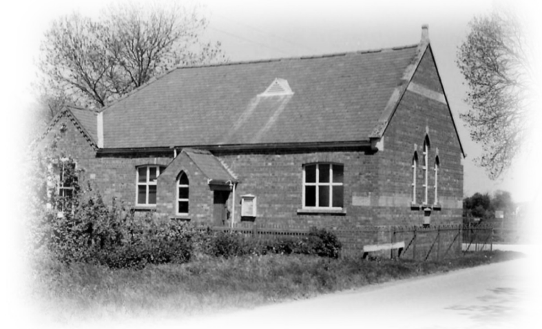
The Chapel many years ago before conversion

Total area: approx. 114.1 sq. metres (1228.6 sq. feet)