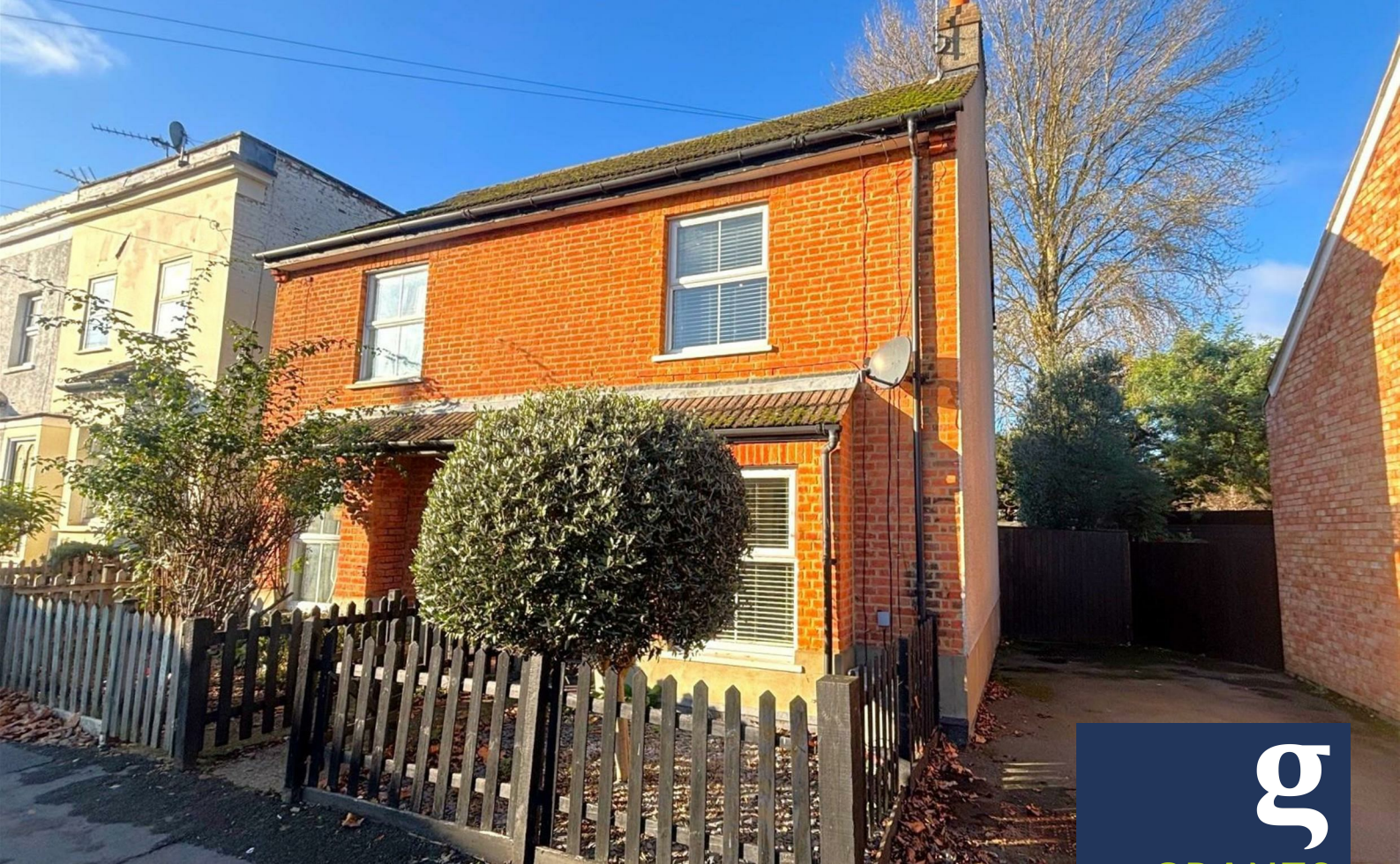
Chapel Park Road, Addlestone, KT15 1UJ