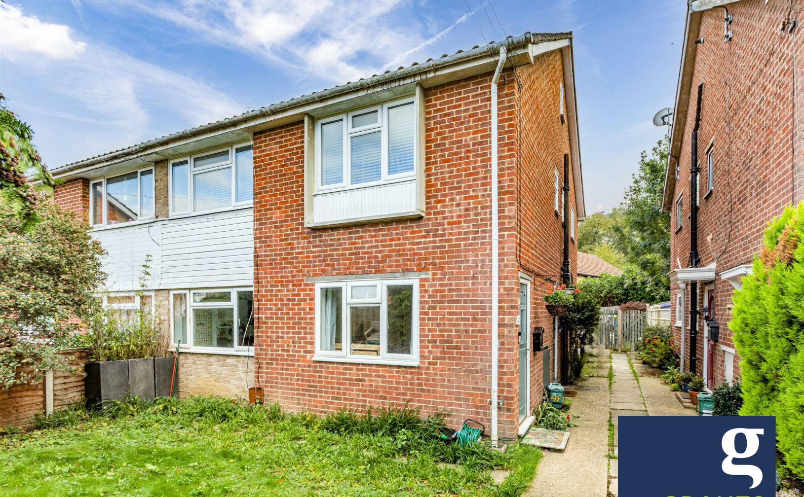
Sandy Road, Addlestone, KT15 1HZ