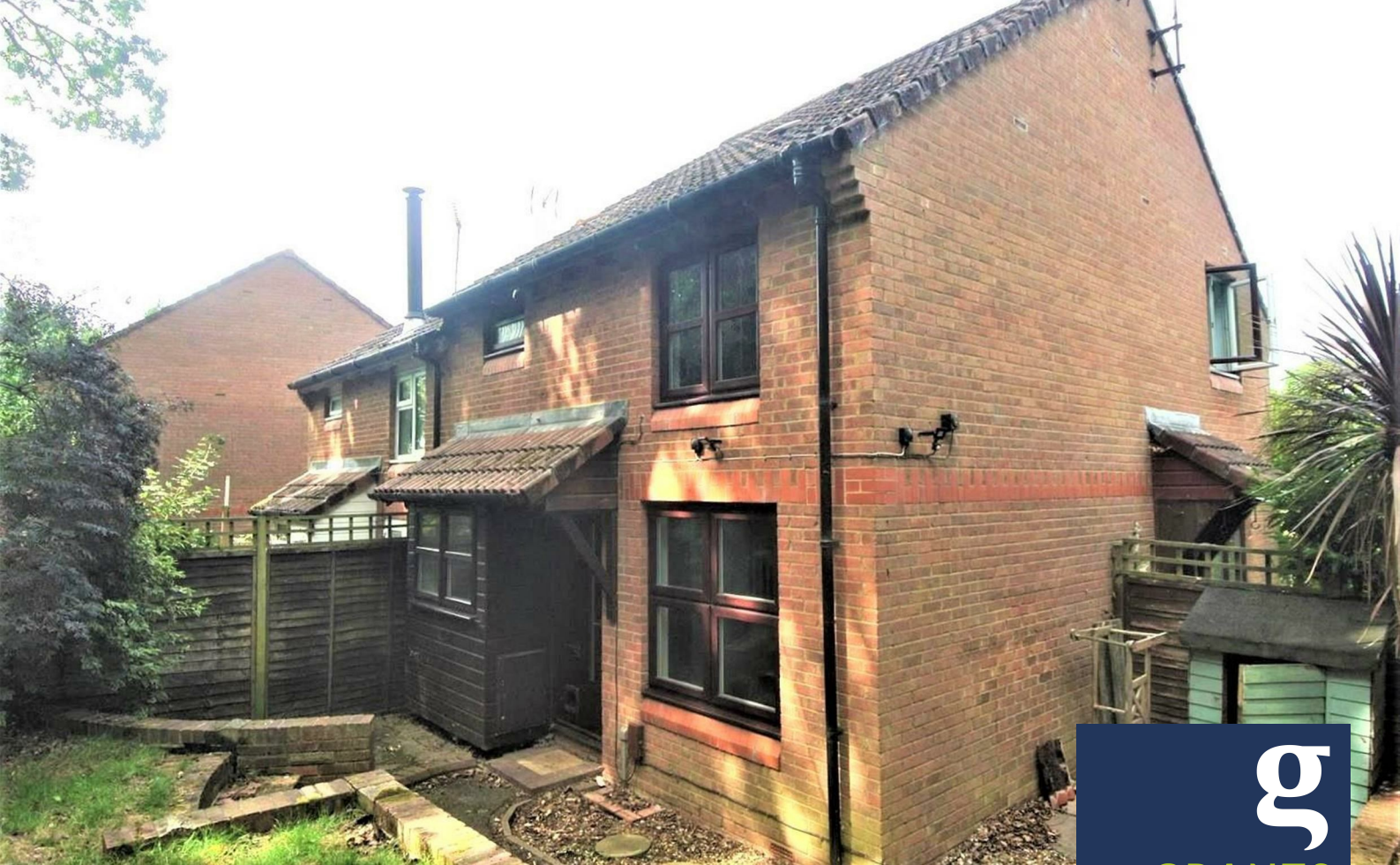
Rowhurst Avenue, Addlestone, KT15 1NF