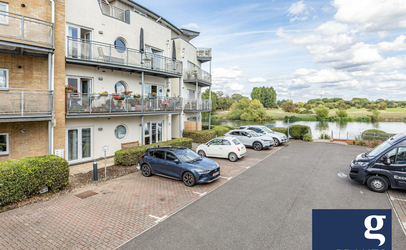
Bridge House, Bridge Wharf, Chertsey, KT16 8JB