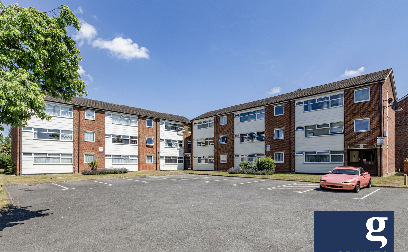
New Court, Addlestone, KT15 2EE