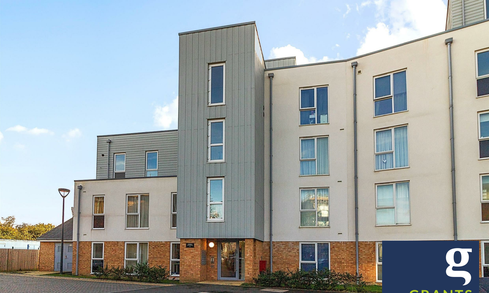
Thaden Apartments, Hawker Drive, Addlestone, KT15 2GS