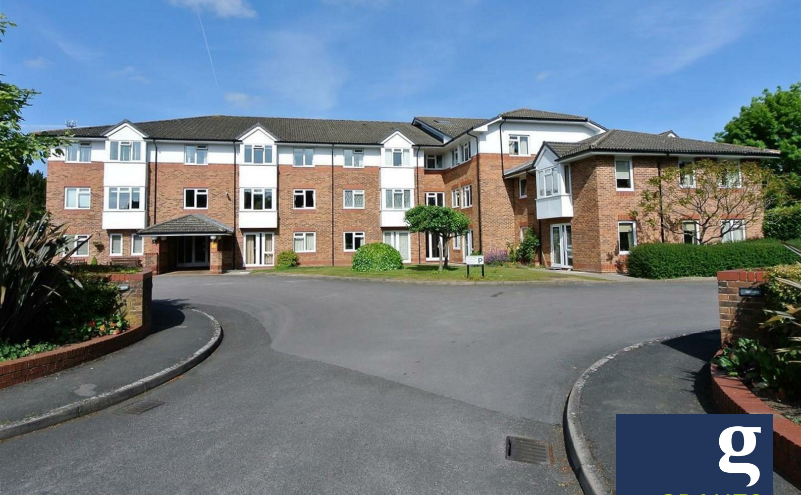
Cedar Court, Crockford Park Road, Addlestone, KT15 2LQ