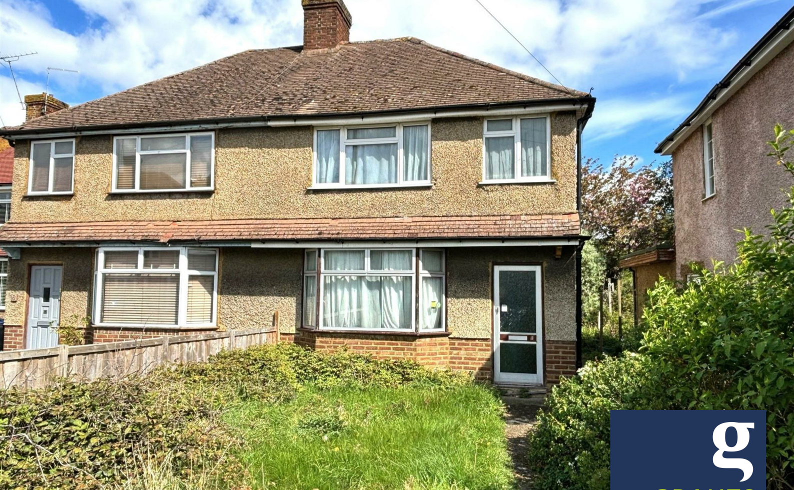
Shakespeare Road, Addlestone, KT15 2ST