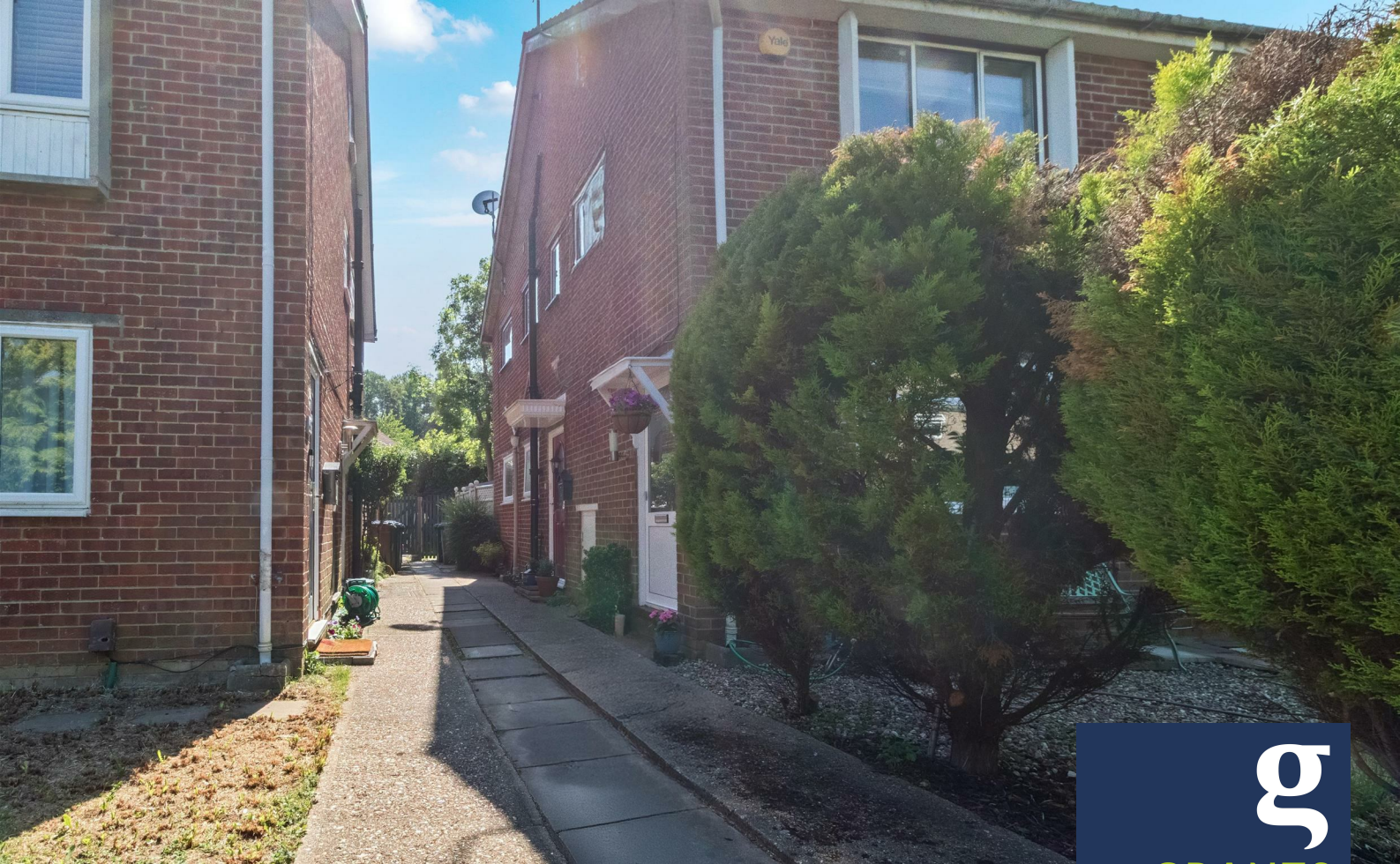
Sandy Road, Addlestone, KT15 1HZ