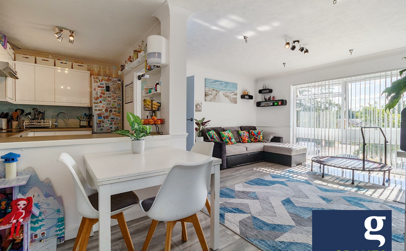
Hazeldene, Crockford Park Road, Addlestone, KT15 2LD