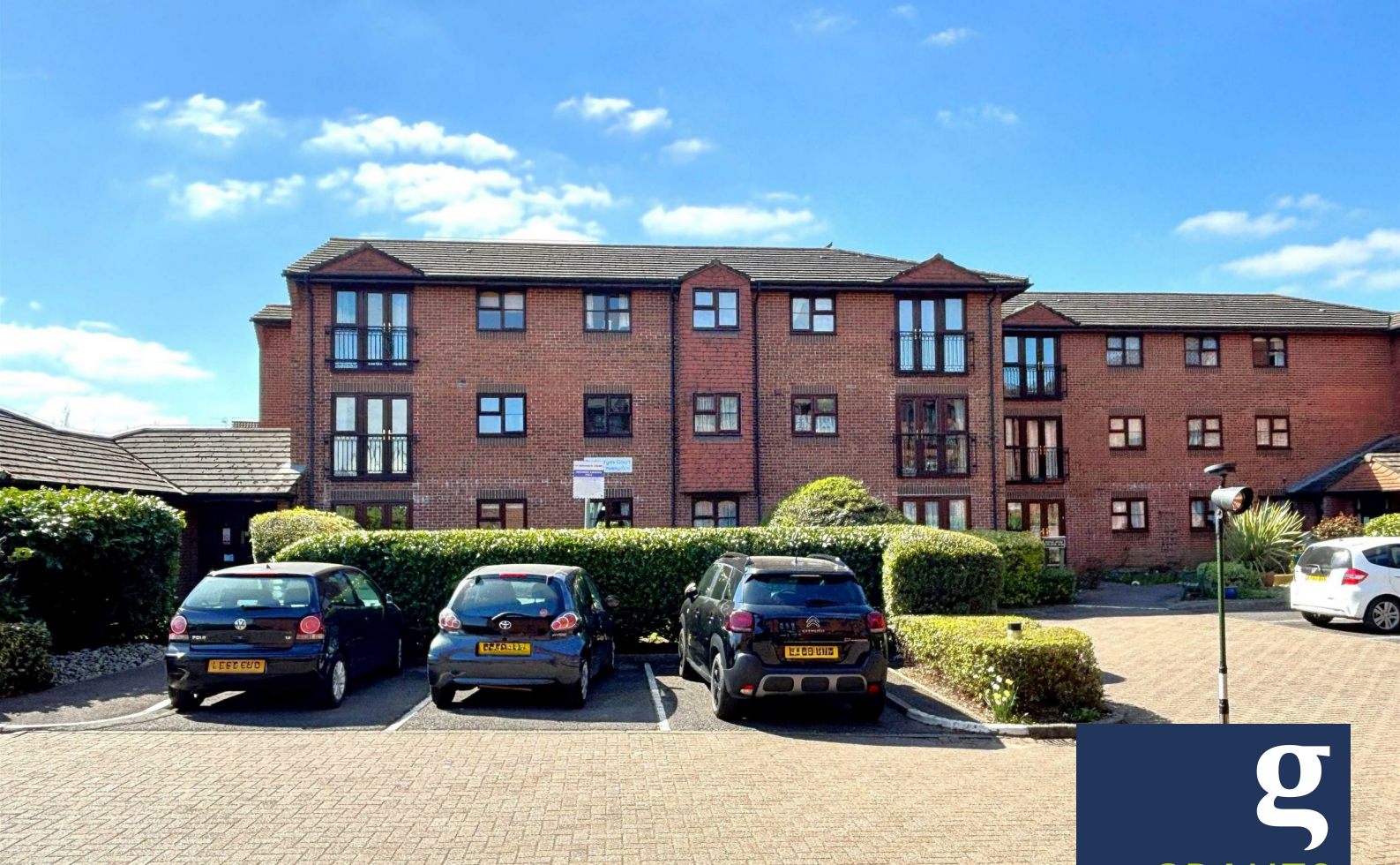
St Georges Court, St. Georges Road, Addlestone, KT15 2AY