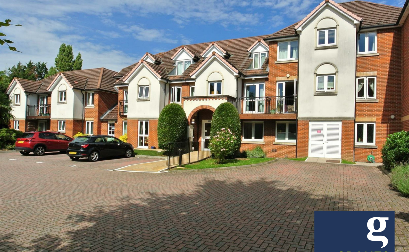
Mead Court, Station Road, Addlestone, KT15 2PR