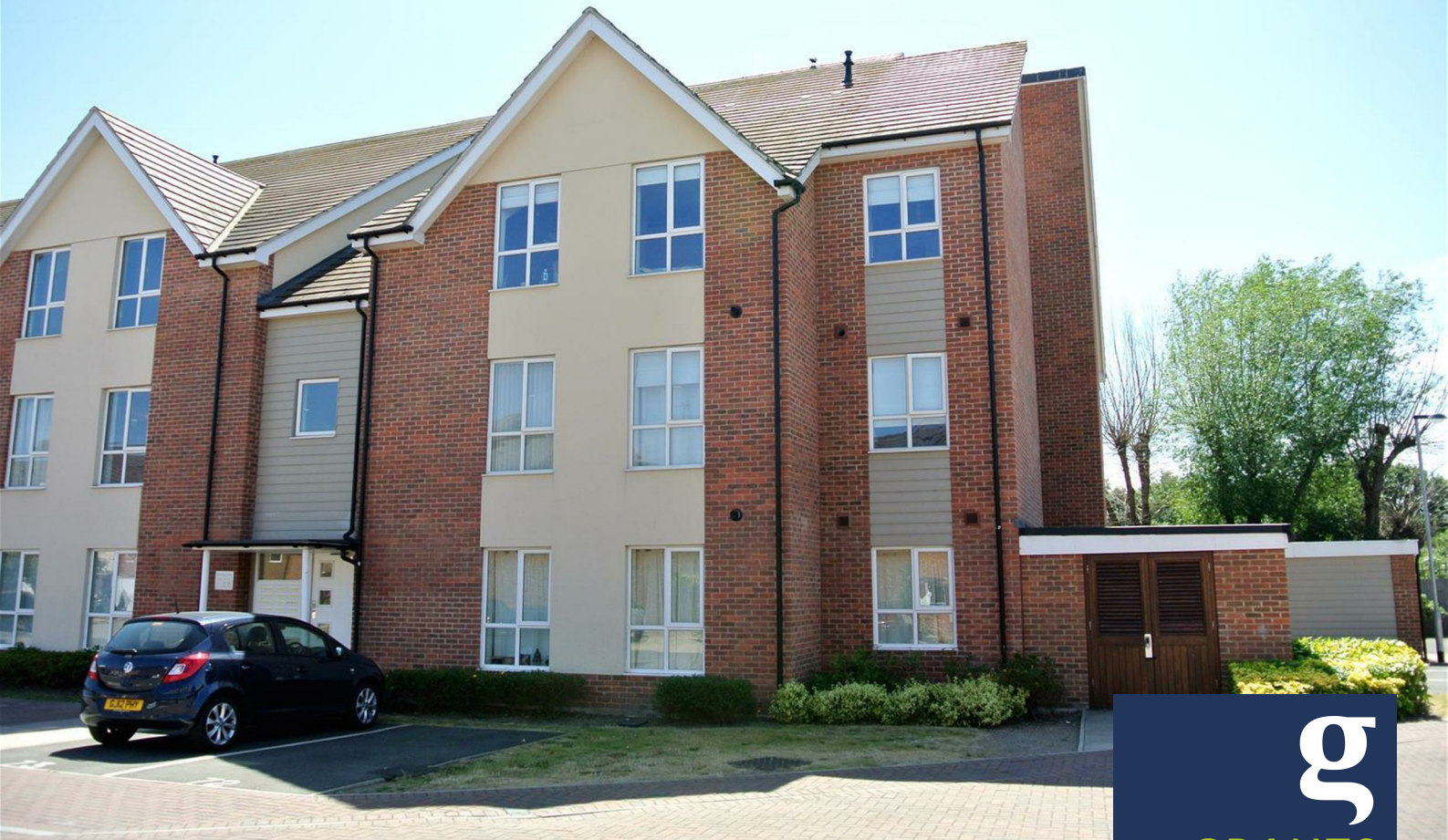
Harrow Close, Addlestone, KT15 2GH