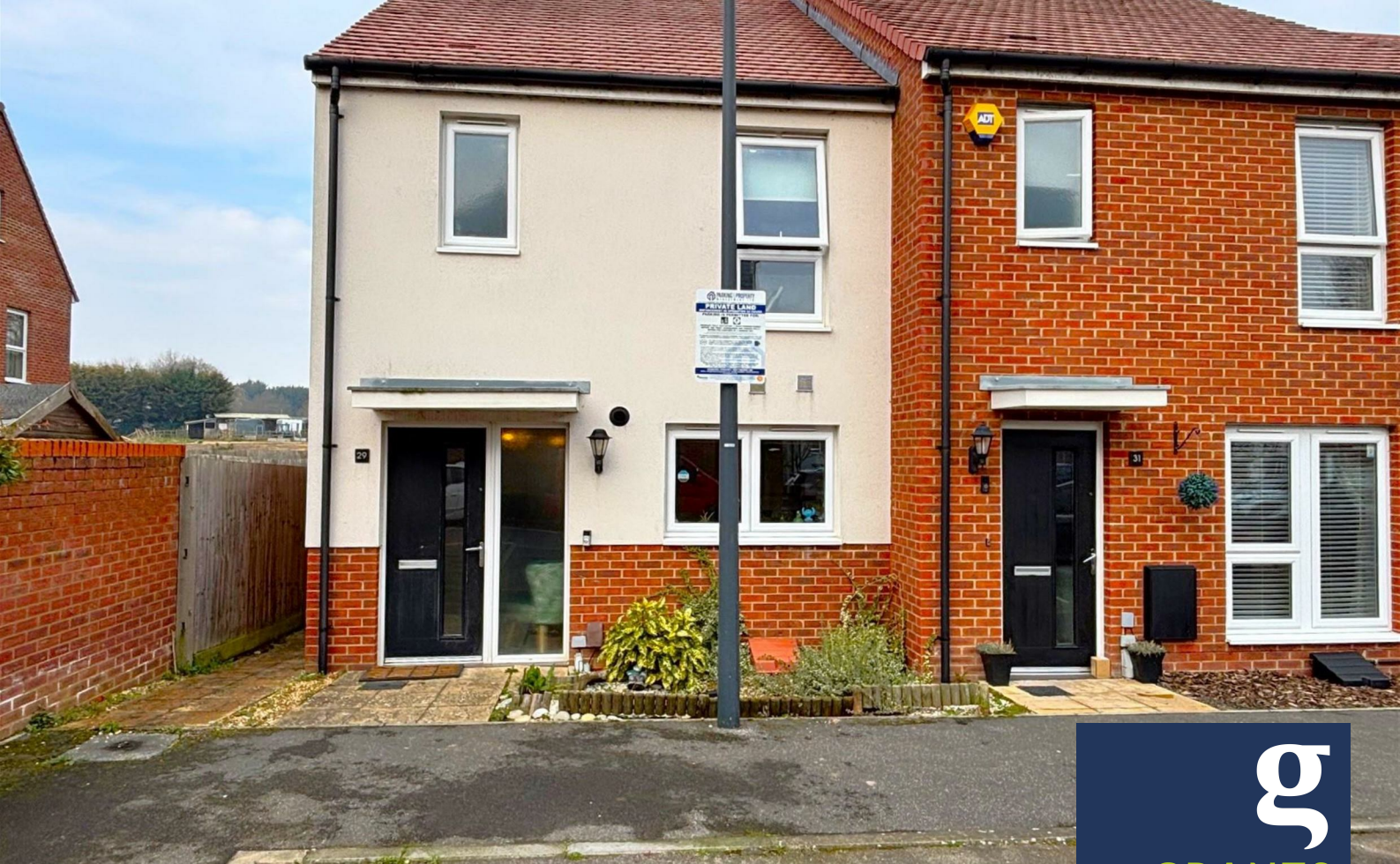
Hawker Drive, Addlestone, KT15 2FP