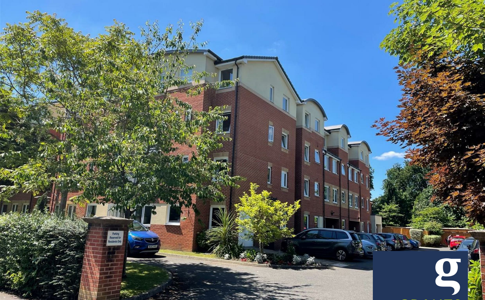
Oaktree Court, Addlestone Park, Addlestone, KT15 1SY