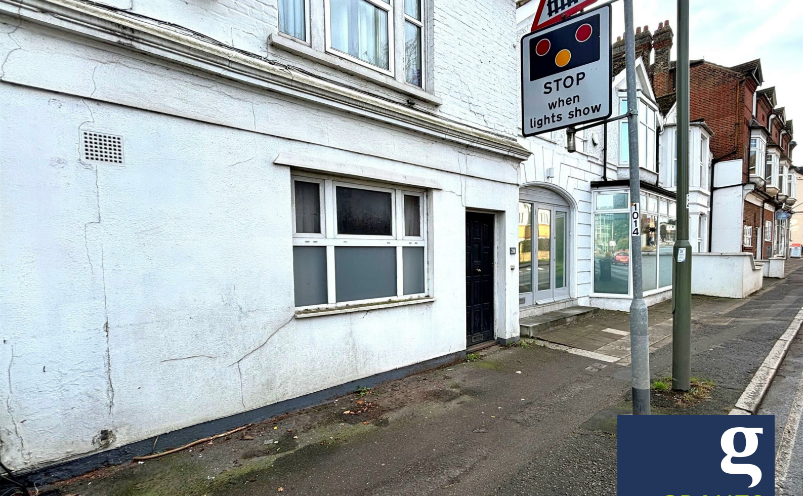
216 Station Road, Addlestone, KT15 2PH