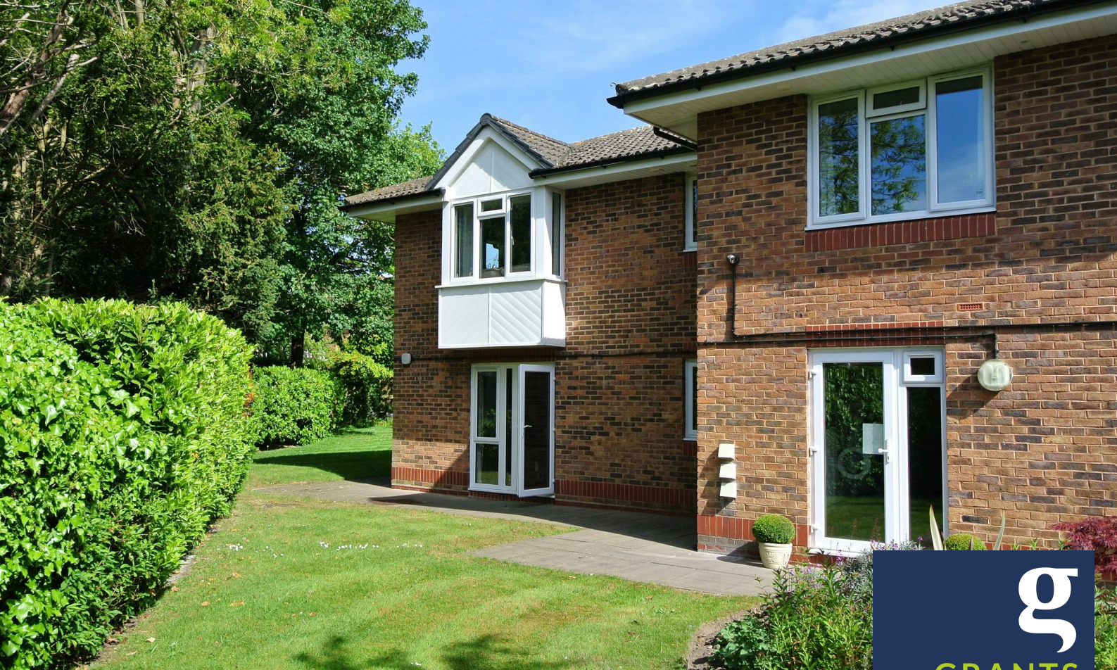
Crockford Park Road, Addlestone, KT15 2LQ