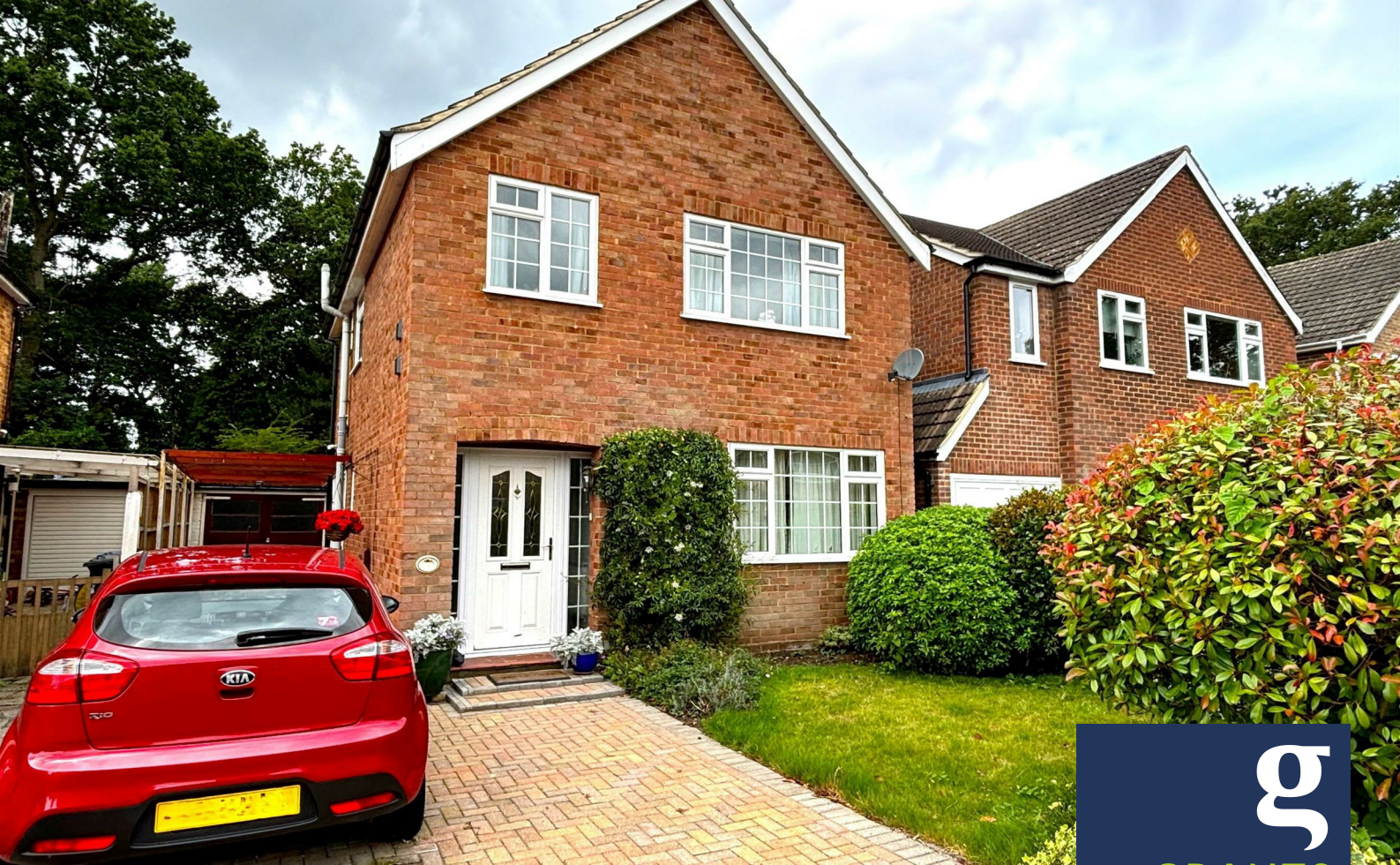
Cobs Way, New Haw, KT15 3AF