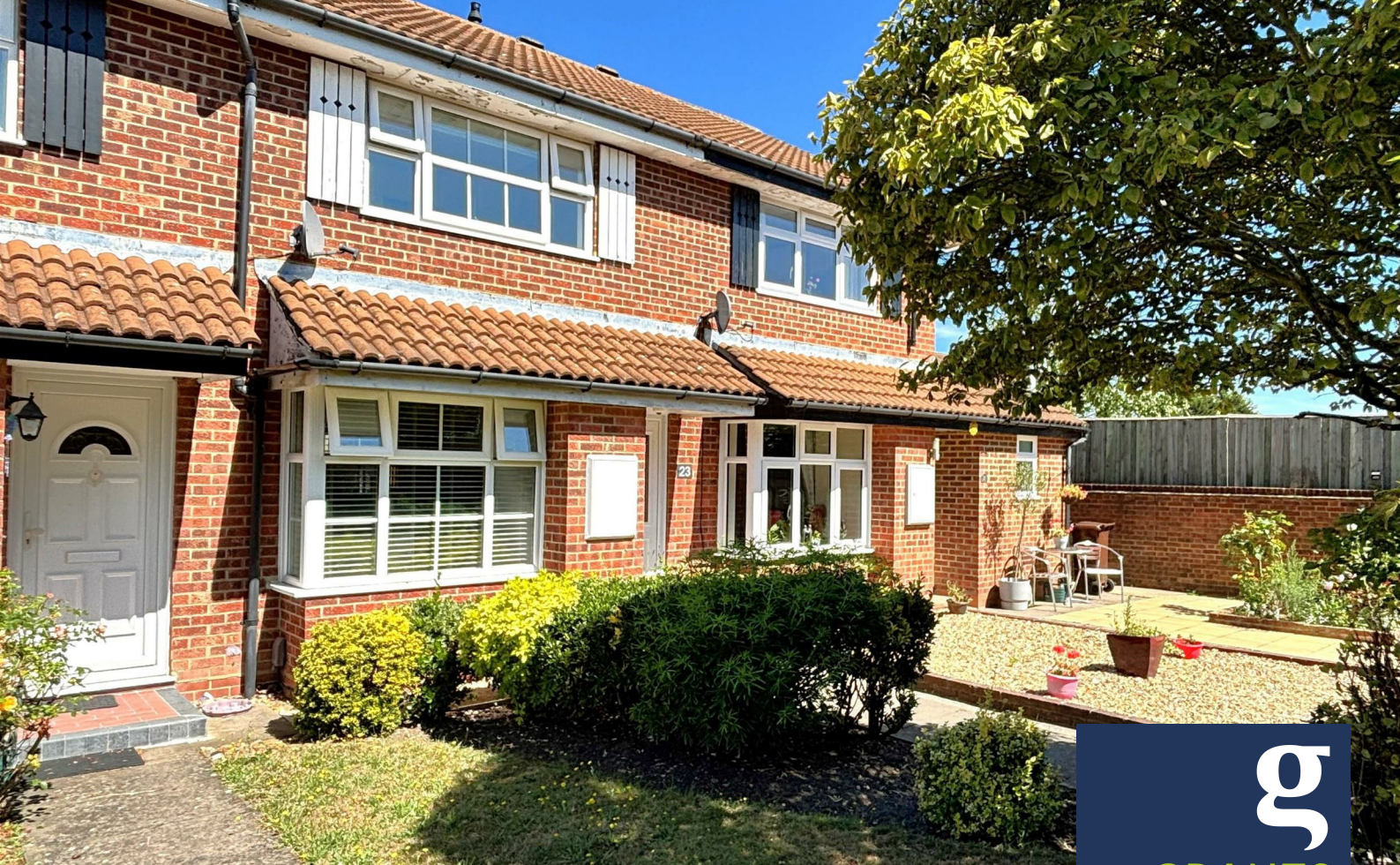
Finlay Gardens, Addlestone, KT15 2XL