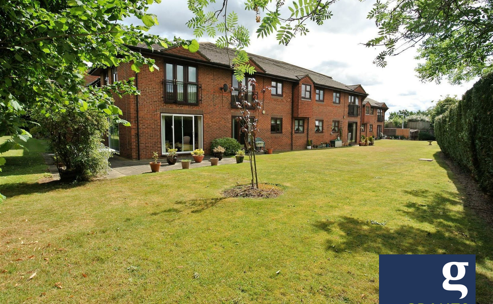
St Georges Court, St. Georges Road, Addlestone, KT15 2AY