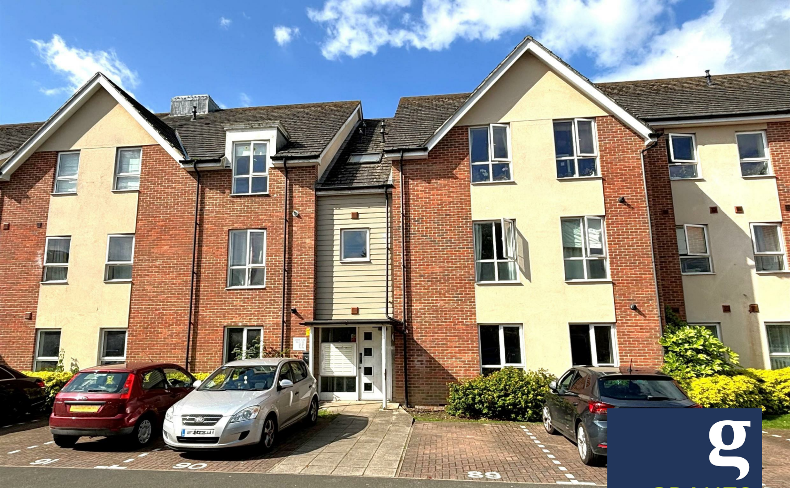
Harrow Close, Addlestone, KT15 2GJ